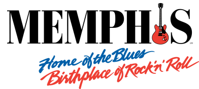
Memphis Convention & Visitor's Bureau