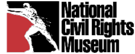
National Civil Rights Museum

Representing Sopot and Gdańsk, we have the following cultural and nonprofit organizations: