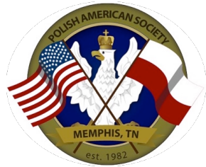
Polish-American Society of Memphis

From Memphis, the following cultural and nonprofit organizations are taking part: