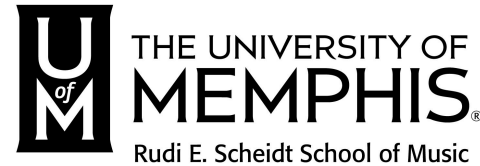
University of Memphis Rudi E. Scheidt School of Music